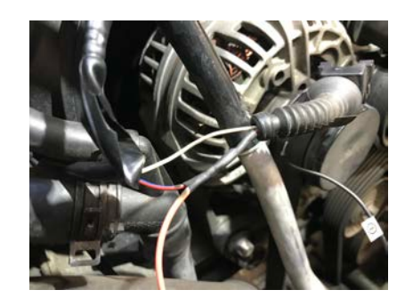
Step 7 Pull 12V key hot power from this solenoid.

Located solenoid between between driver side intake runners