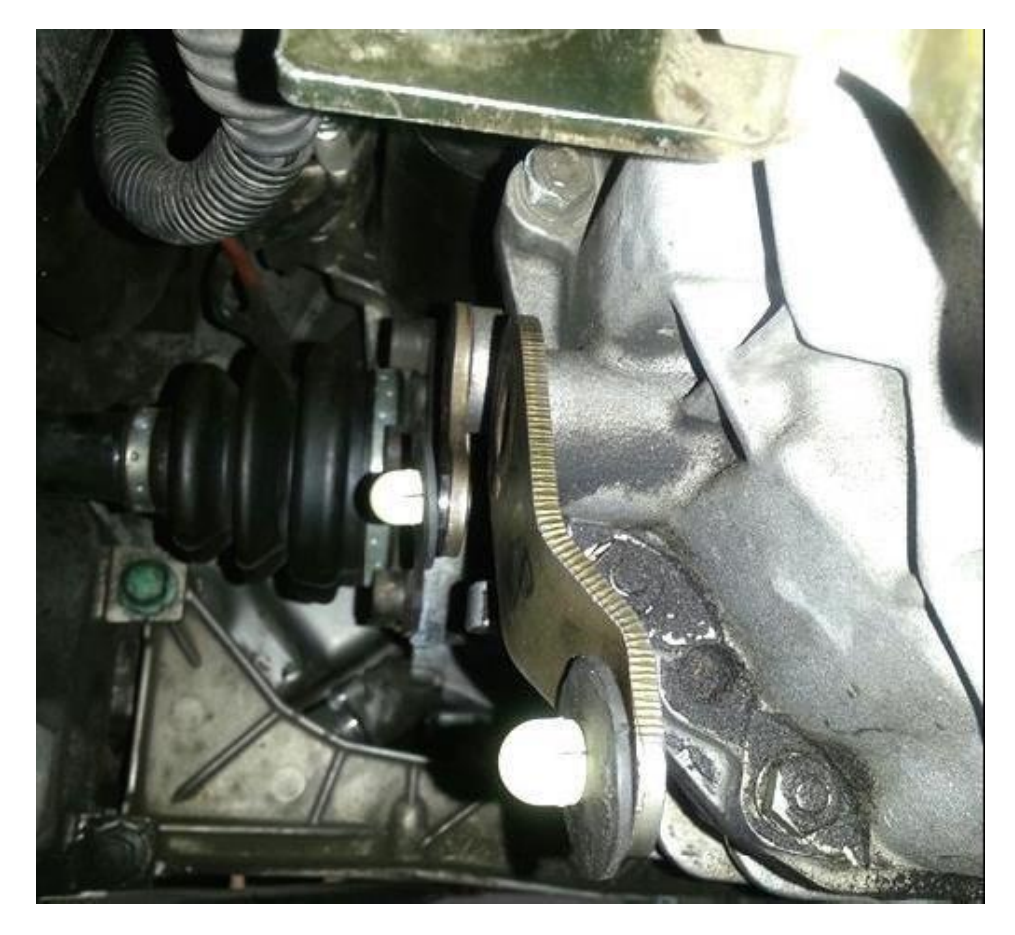
This transmission picture view indicates the yellow plastic inserts applied on the transmission cable posts before rod end fitment.