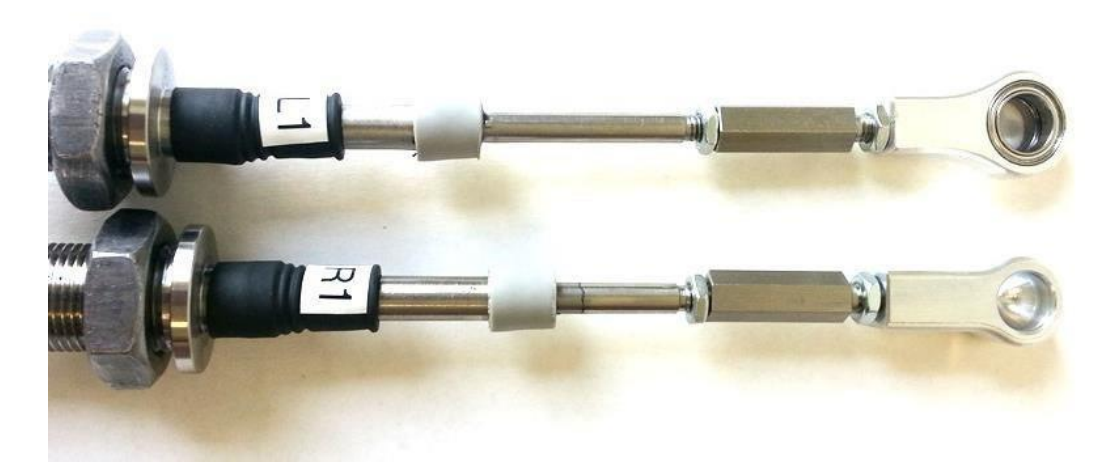
Note: It is recommended to reuse the OEM rubber bushing included on the OEM cables.