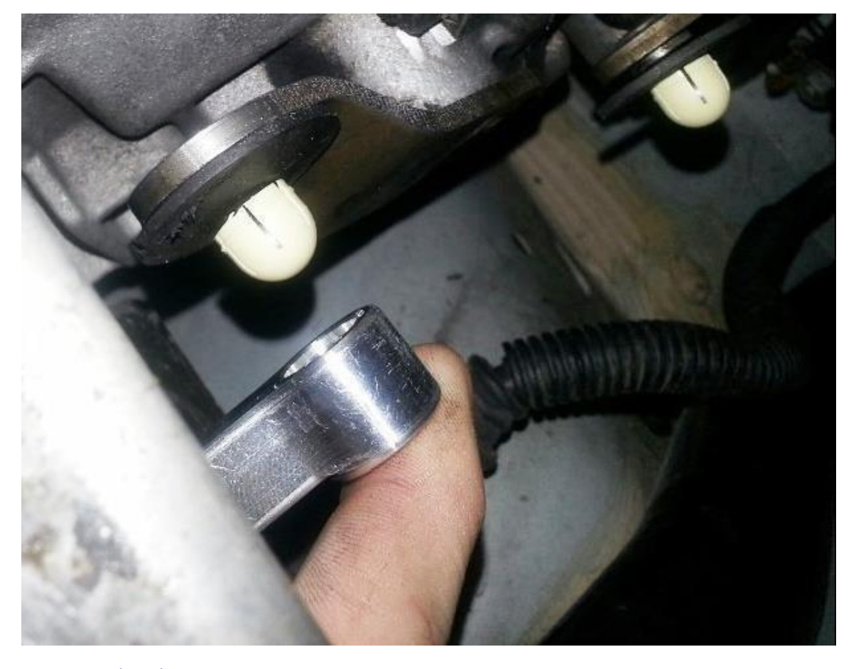
Connect rod end to post.