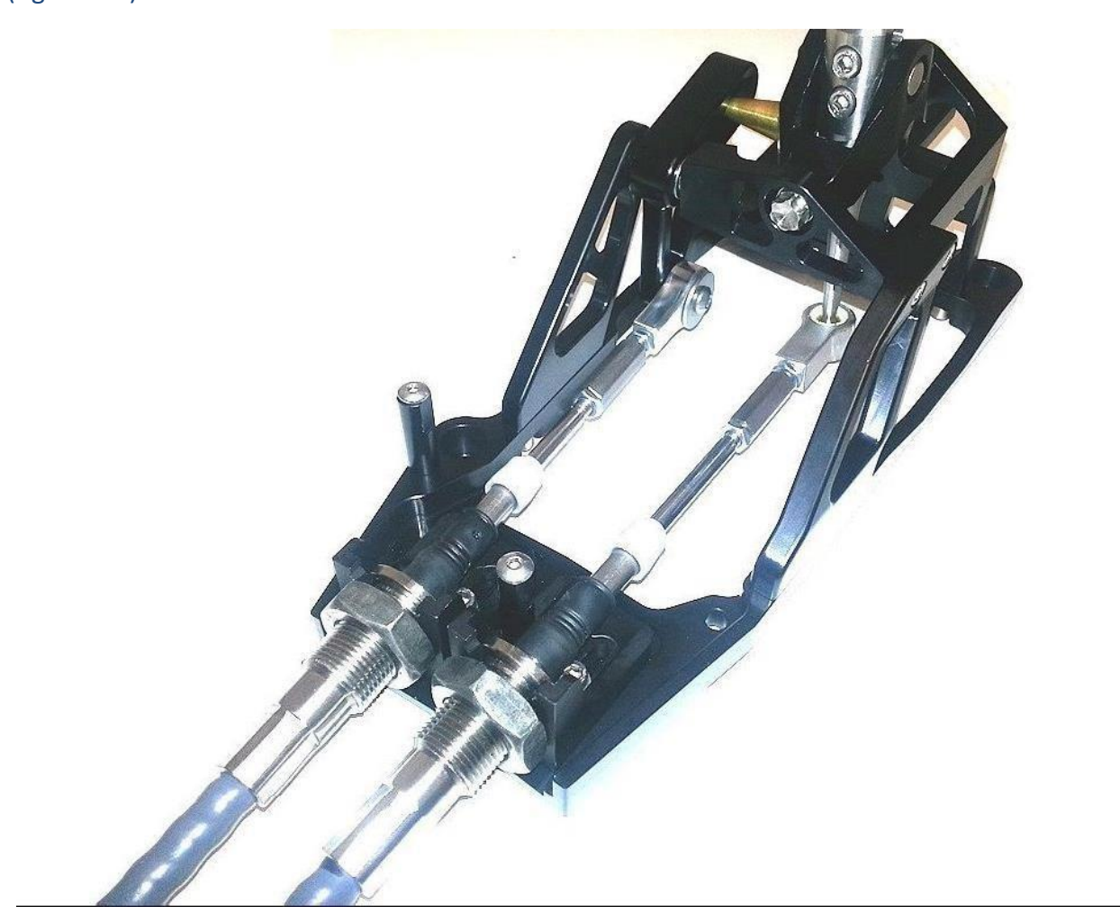
This picture indicates the cables installed correctly.

Adjustment will move shift lever position. Be sure to have lever in desired position before securing (tightened).