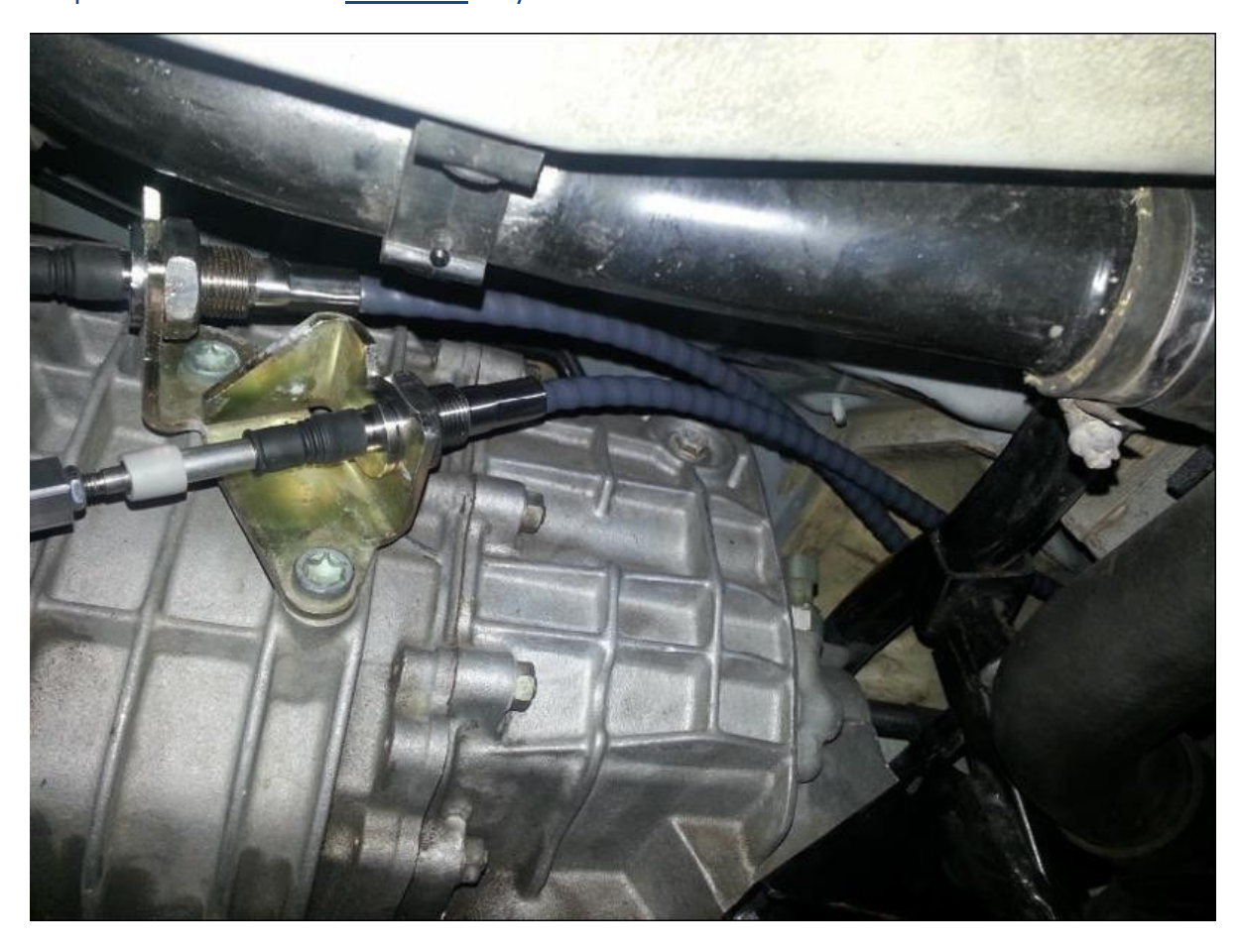
This picture is the INCORRECT way!