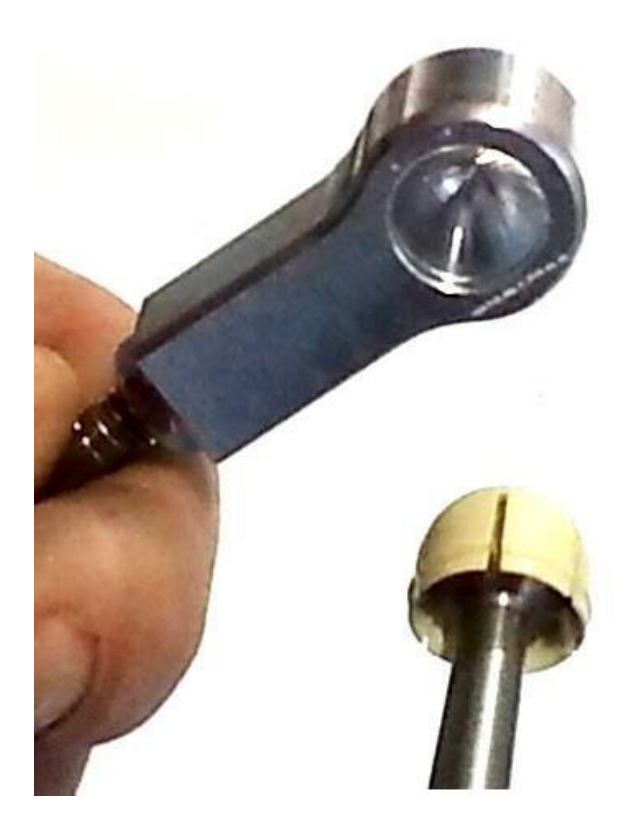
When installing the cables components make sure to apply the plastic caps to all ball end mounts.