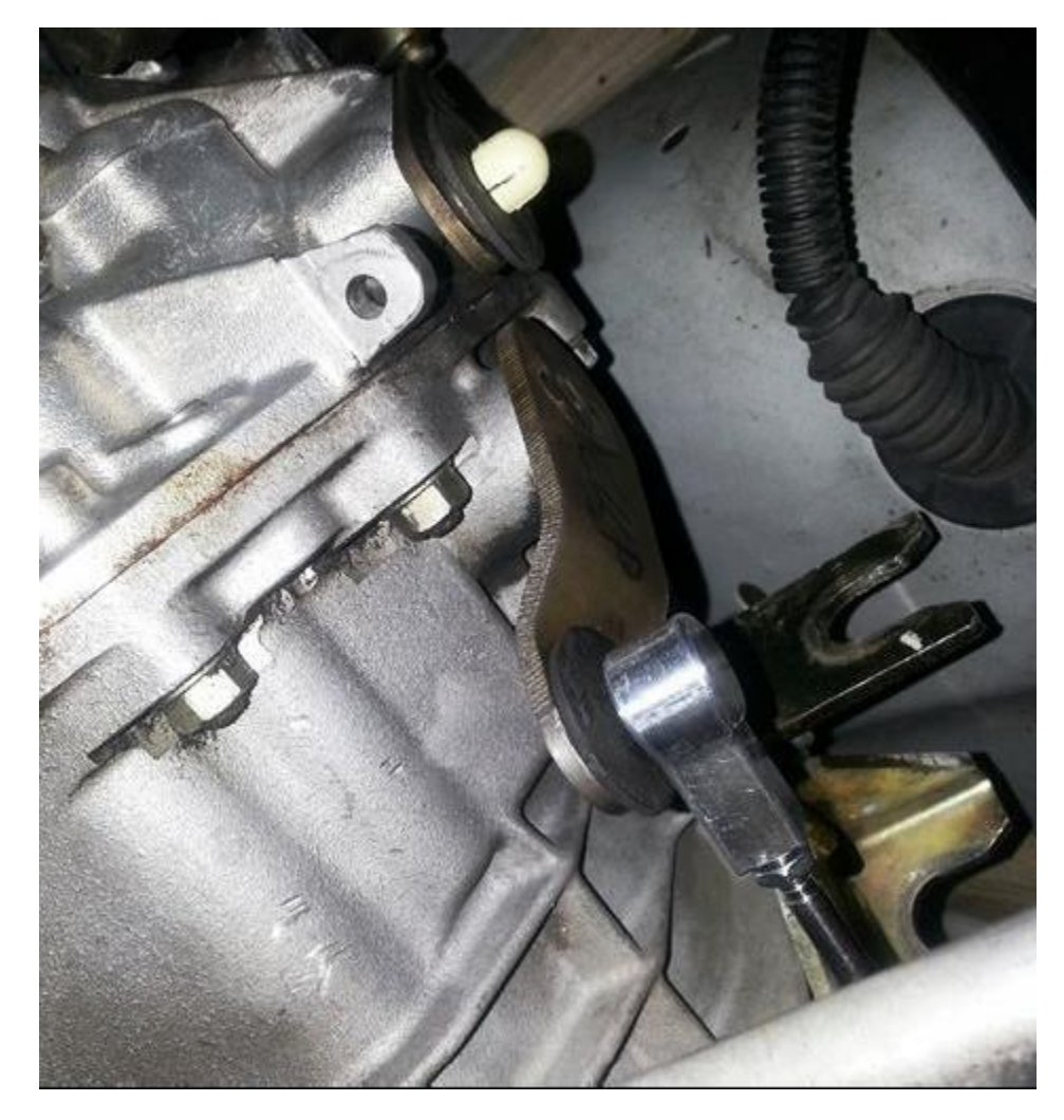
Attached and secured correctly (Requires force to remove).