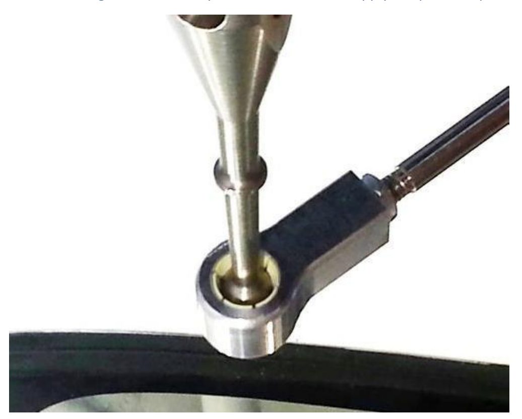
The picture indicates a complete connection. (May require some force).

Note: be sure to make adjustments before connecting the rod ends.