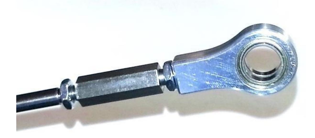
The ball bearing rod end is fully adjustable and attaches to the left side of the shifter (not tightened).