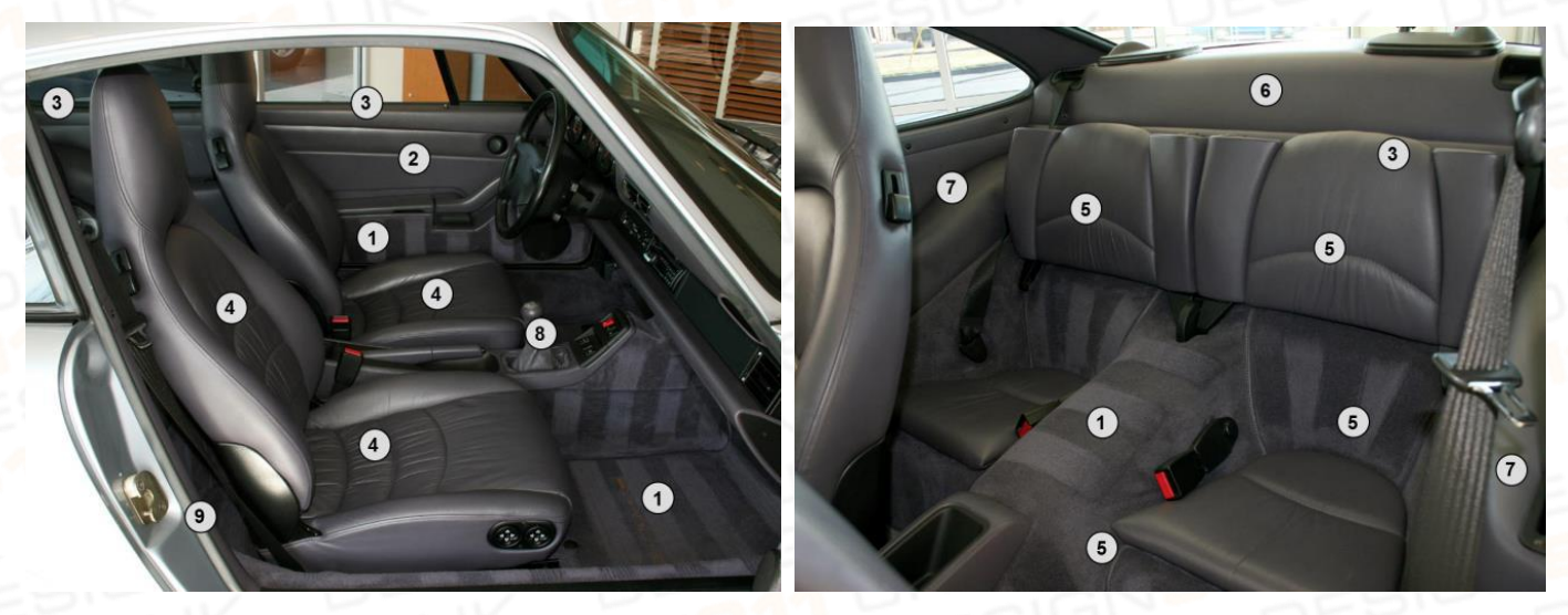
Note: Picture shows '95 Coupe interior with Bose sound system. Slight variations apply throughout the '94-'98 period. All our interior kits are manufactured specifically for your year and chassis number.

Our Standard Interior Restoration Kit for the Porsche 993 Coupe '94-'98 includes everything you typically need to bring your interior back to factory new condition: