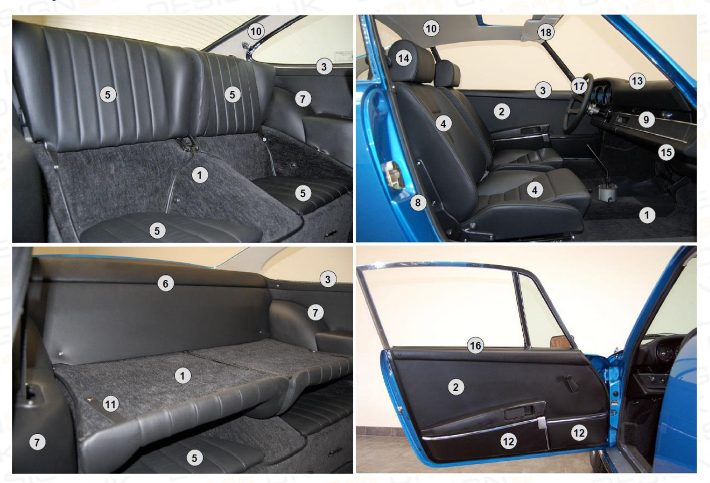
Note: Pictures show '73 911S Coupe interior with sport seats. Slight variations apply throughout the '66-'73 period. All our interior kits are manufactured specifically for your year and chassis number.

Our Standard Interior Restoration Kit for the Porsche 911 '66-'73 includes everything you typically need to bring your interior back to factory new condition: