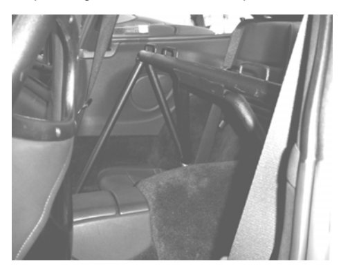
Step 12. Tighten all fasteners. Completed installation should look like this.