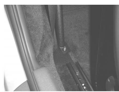
Step 11. Position support tube as shown and install 7/8" bolts and washers at each end as shown below. (Passenger side shown)