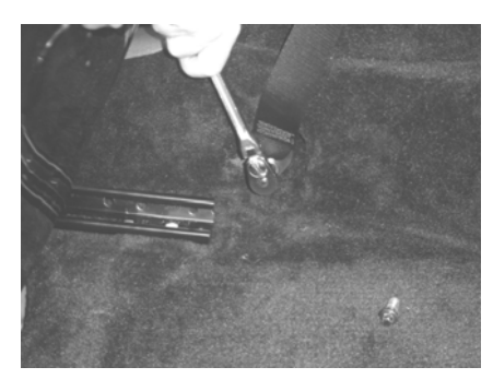
Step 2. Remove outside lap belt, mounting bolt and spacer located along the doorsill.