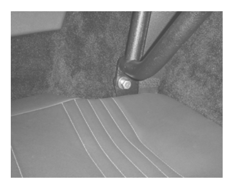
Step 10 Position main bar as shown. Note: you may have to lightly pry the rear mounting brackets to position the main bar between them. Install 7/8" long bolts and washers. (One for each side.) Do not tighten at this time.