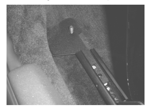
Step 4. Position large stepped spacer (supplied) at outside belt mounting point. This replaces the factory spacer. Place lap belt end bracket over stepped spacer. Make sure the belt is oriented properly. Position the floor mount bracket as shown. Install supplied 2" long bolt and washer. Note: do not tighten and this time. (SEE ATTACHED DRAWING 1029-A)