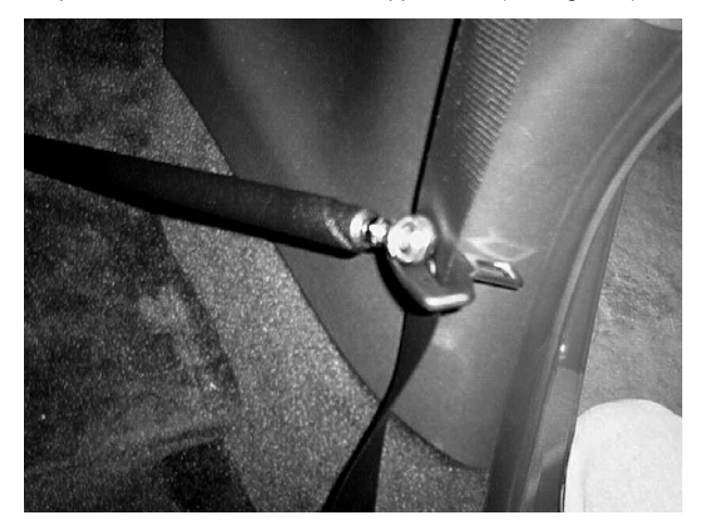
Step 7. Tighten rear seat belt mounting bolts left loose from step 2.

Step 8. Check that all hardware is tight.