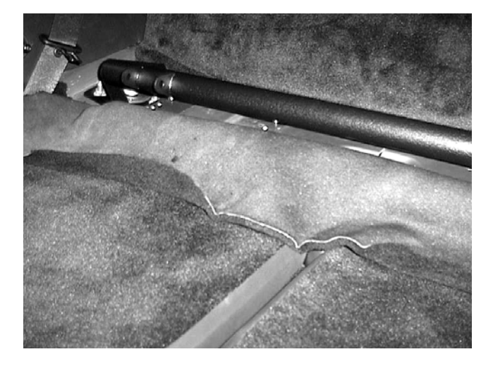
Step 5.Attach the harness-mounting bar to the rear-mounting bar with the supplied hardware as shown. (See figures 5 & 6)

Step.4 Remove the (3) strut mounting nuts on each side. Position the rear-mounting bar as shown. (See figure 4) Reinstall nuts and torque to factory specs. Reposition carpet.