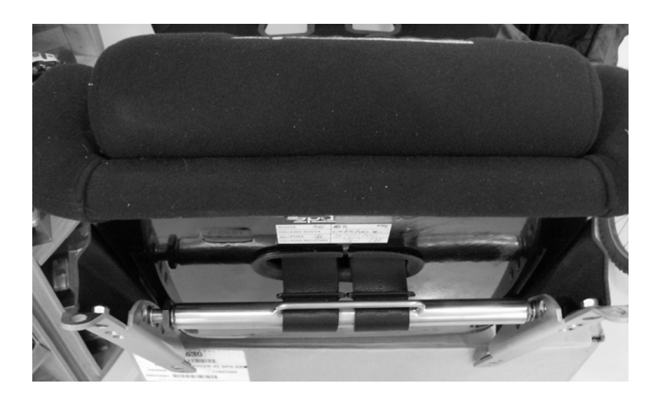
Step 5. Reinstall the seat assembly in the car with the stock E-12 Torx bolts. A E-12 wrench will be needed to tighten the rear bolts if the furthest back position is used (the rear most mounting hole on the R-907X bracket will be positioned over the rear floor pan bolts.

Step 4. Remove the R-9044 from the car. Having the race seat on its back with the side mounts attached, position the R-9044 under the side mounts. Secure with the (4) black flat socket head bolts, high strength washers, and zinc lock nuts.